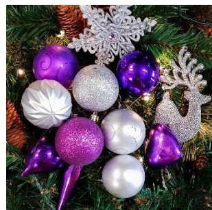
Silver & Purple