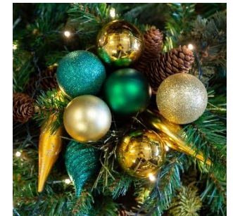
Gold & Green