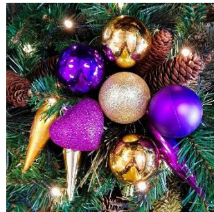
Gold & Purple