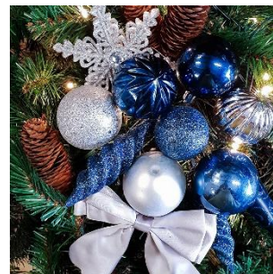
Silver & Blue