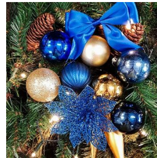
Gold & Blue