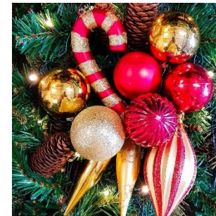
Gold & Red