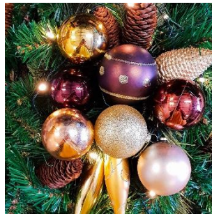
Bronze, Copper & Gold