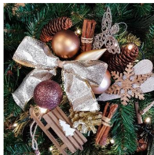
Natural & Gold